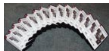
Training Programs w/ Certification